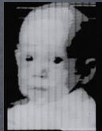
First digital image on SEAC in 1957